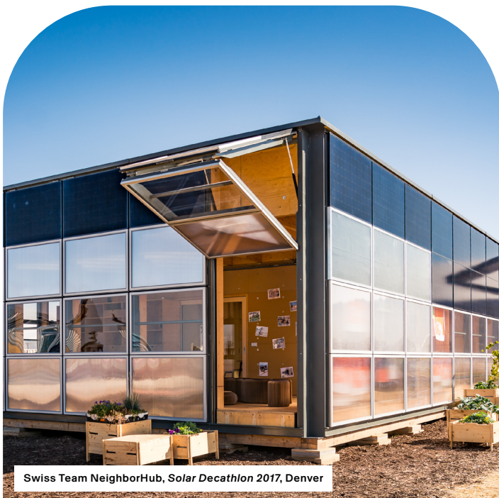
Swiss Team NeighborHub, Solar Decathlon 2017 , Denver